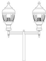
Street Lighting / Acorn